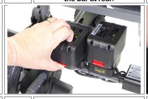
Insert batteries until they click into place. Your Power Chair is now ready.