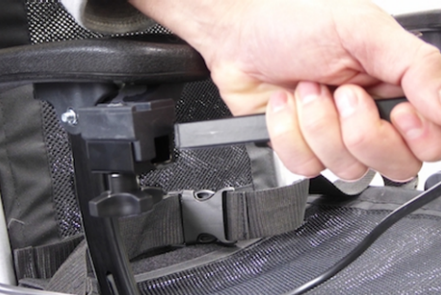
...insert the controller rod into the armrest fitting under the armrest...