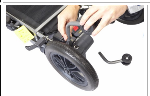
Install the anti-tip wheels. These simply press and lock into place.