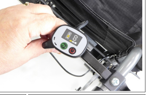
... Remove attendant control from back pocket and attach to the bar at rear.