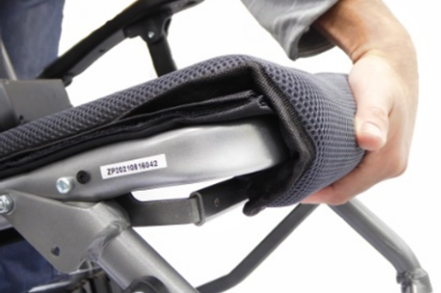
Unfold Power Chair by pushing the seat bottom down while pulling the release lever up.