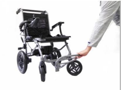
Pull foot rest down.