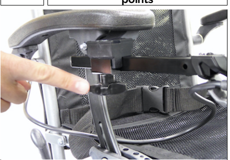
adjust the position of the controller and tighten with the knurled knob.